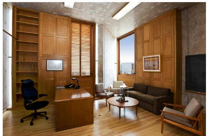
View of an office in the north study towers, showing the oak paneling at the interior of the window wall assemblies