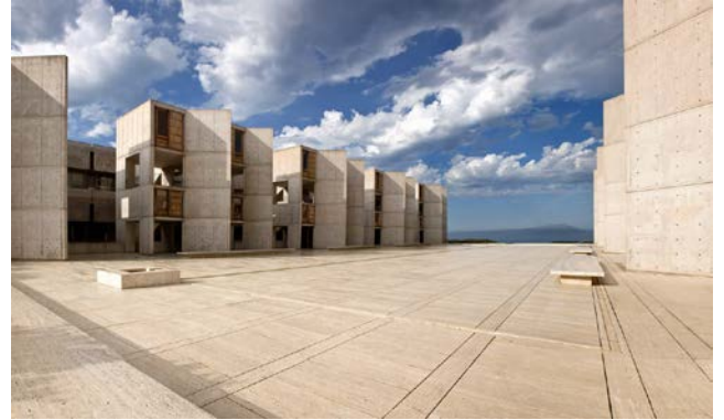
View of the central plaza at the Salk Institute for Biological Studies, looking towards the south study towers