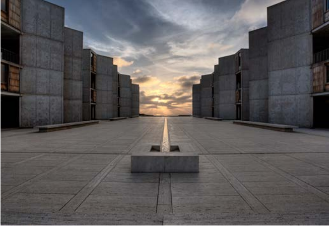
View of the central plaza at the Salk Institute for Biological Studies, looking west towards the Pacific Ocean