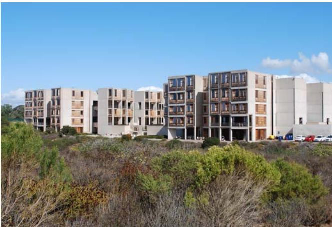
View of the west office wings at Salk Institute for Biological Studies