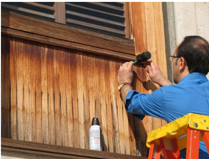
View of the GCI project team collecting samples for laboratory analysis