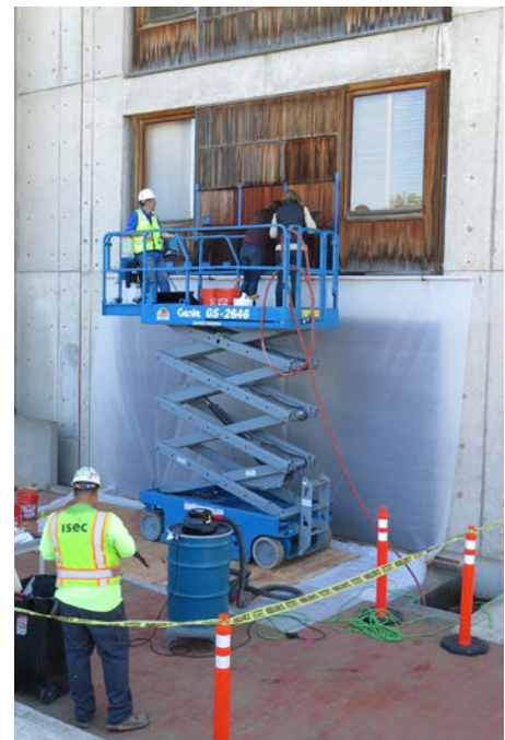
View of the project team undertaking cleaning tests during the trial mock-up phase