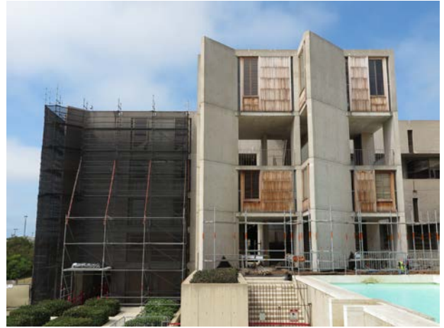
Construction activities underway at the west office wing (left) and study towers (right), summer 2016