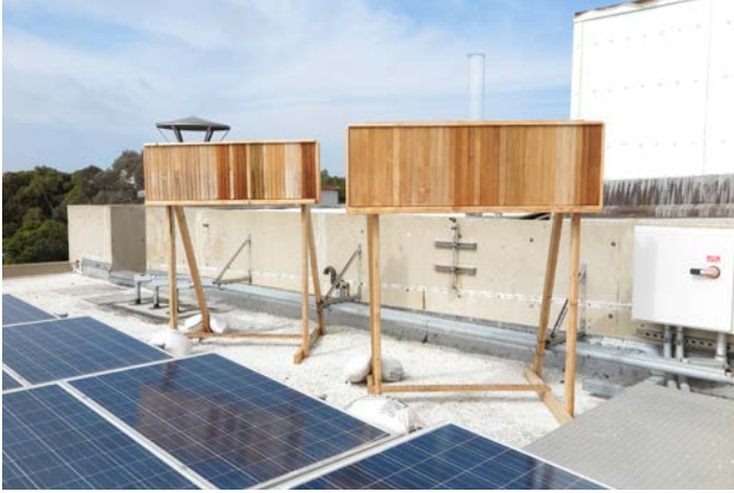
During the project mock-up phase, different finishes were trialed on sample panels of existing weathered (left) and new (right) teak