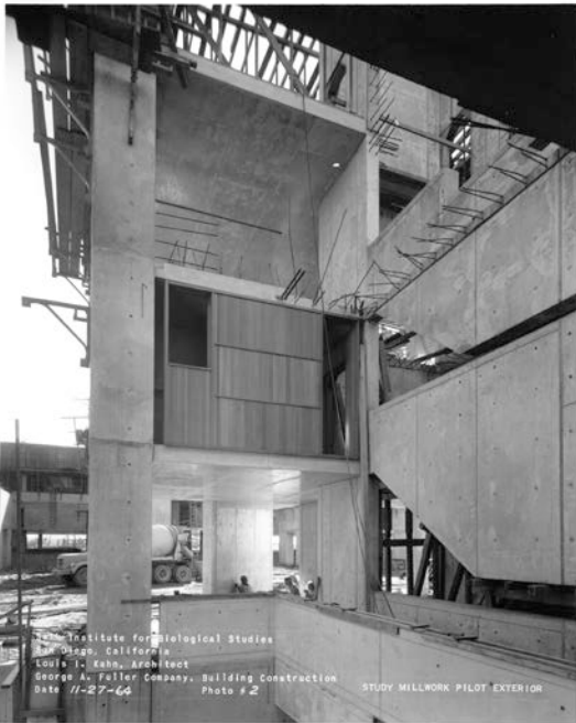
View of the first, or "pilot," window wall to be installed during construction, 1964