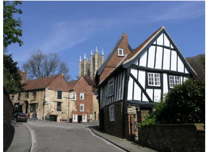
City of Lincoln, view north along Michaelgate