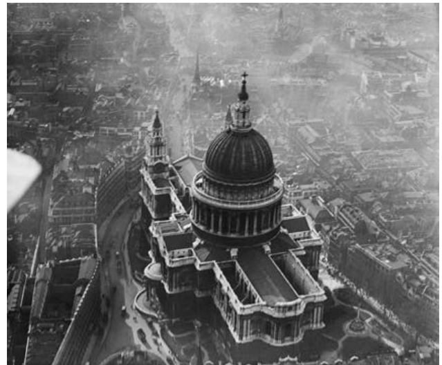
St. Paul's Cathedral, London, 1921