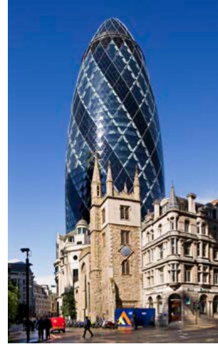
Church of St. Andrew Undershaft, St. Mary Axe, City of London. 11 July 2012.