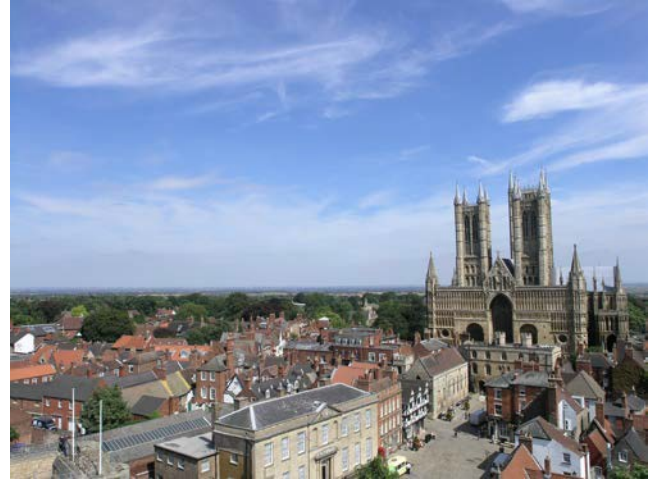
City of Lincoln, view from castle walls to cathedral