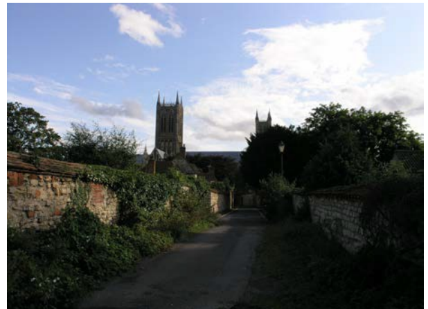
City of Lincoln, James Street looking towards cathedral