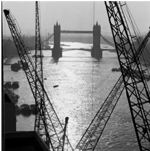
Tower Bridge by John Gay, 1946 – 1964