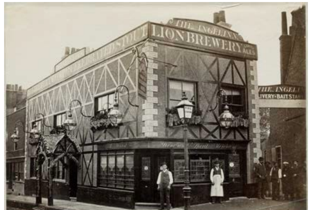
The Angel Inn, Highgate, London. 1882