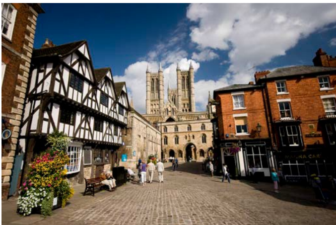
City of Lincoln, Castle Square