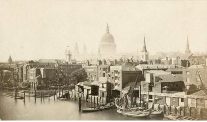
St. Paul's Cathedral from Southwark Bridge, City of London, 1855-9