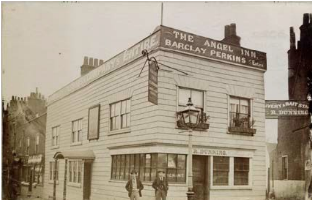
The Angel Inn, Highgate, London c. 1874