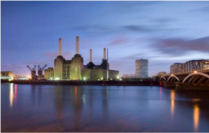
Battersea power station