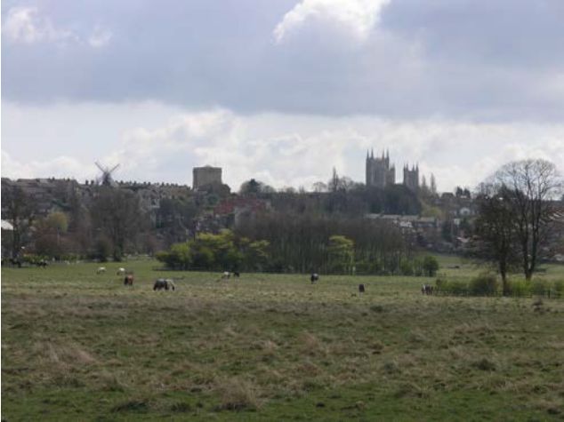
City of Lincoln, view across west common to Lincoln hillside