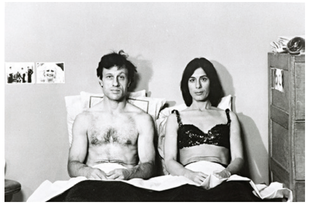
6. Yvonne Rainer American, born 1934 Still from Kristina Talking Pictures , 1976 The Getty Research Institute © Yvonne Rainer 2006.M.24