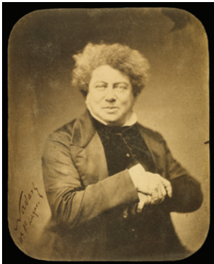
3. Nadar [Gaspard Félix Tournachon] French, 1820–1910 Alexander Dumas [père] (1802–1870) / Alexandre Dumas , 1855 Salted paper print Image (rounded corners): 23.5 x 18.7 cm (9 1/4 x 7 3/8 in.) The J. Paul Getty Museum, Los Angeles 84.XM.262.4