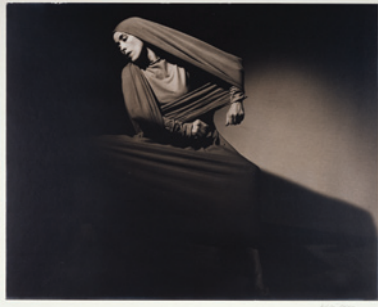
11. Barbara Morgan American, 1900–1992 Martha Graham - "Lamentation", 1935 Gelatin silver print Image: 38.2 x 48.3 cm (15 1/16 x 19 in.) The J. Paul Getty Museum, Los Angeles 96.XM.61.2