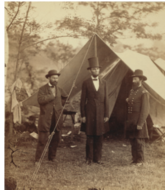
4. Alexander Gardner American, born Scotland, 1821–1882 President Lincoln, United States Headquarters, Army of the Potomac, near Antietam , October 4, 1862 Albumen silver print Image: 21.9 x 19.7 cm (8 5/8 x 7 3/4 in.) The J. Paul Getty Museum, Los Angeles 84.XM.482.1