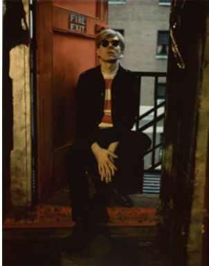
1. Marie Cosindas American, born 1925 Andy Warhol , 1966 Dye color diffusion [Polaroid®] print Image: 11.4 x 8.9 cm (4 1/2 x 3 1/2 in.) The J. Paul Getty Museum, Los Angeles © Marie Cosindas 2011.2.6