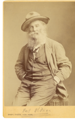
6. Mathew B. Brady American, about 1823–1896 Walt Whitman , about 1870 Albumen silver print Image: 14.6 x 10.3 cm (5 3/4 x 4 1/16 in.) The J. Paul Getty Museum, Los Angeles 85.XE.240