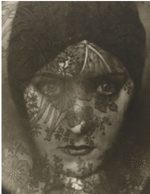
7. Edward Steichen American, 1879–1973 Gloria Swanson , 1924 Gelatin silver print Image: 27.8 x 21.6 cm (10 15/16 x 8 1/2 in.) The J. Paul Getty Museum, Los Angeles © Permission Joanna T. Steichen 84.XM.848.5