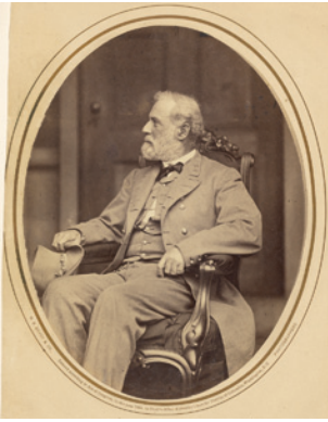
5. Mathew B. Brady American, about 1823–1896 Robert E. Lee , April 16, 1865 Albumen silver print Image (oval): 20.8 x 15.9 cm (8 3/16 x 6 1/4 in.) The J. Paul Getty Museum, Los Angeles 84.XM.479.12