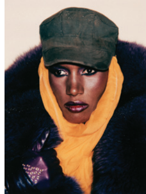
2. Andy Warhol American, 1928–1987 Grace Jones , 1984 Polaroid Polacolor print Image: 9.5 x 7.3 cm (3 3/4 x 2 7/8 in.) The J. Paul Getty Museum, Los Angeles © 2011 The Andy Warhol Foundation for the Visual Arts / Artists Rights Society (ARS), New York 98.XM.168.9