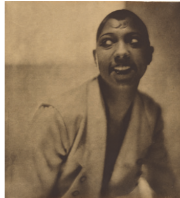
8. Baron Adolf De Meyer American, born France, 1868–1946 Portrait of Josephine Baker , 1925 Collotype print Image: 39.1 x 39.7 cm (15 3/8 x 15 5/8 in.) The J. Paul Getty Museum, Los Angeles 84.XP.452.5