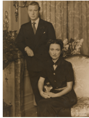
12. Vincenzo Laviosa Italian, 1889–1935 The Duke and Duchess of Windsor , about 1934 Gelatin silver, toned print Image: 34.1 x 26 cm (13 3/8 x 10 1/4 in.) The J. Paul Getty Museum, Los Angeles 84.XP.208.69