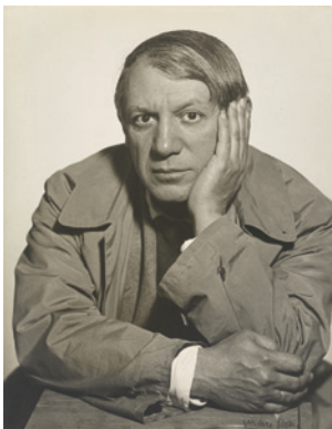
9. Man Ray American, 1890–1976 Pablo Picasso , 1934 Gelatin silver print Image: 25.2 x 20 cm (9 15/16 x 7 7/8 in.) The J. Paul Getty Museum, Los Angeles © Man Ray Trust ARS-ADAGP 84.XM.1000.77