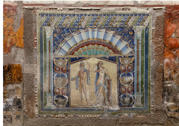
Mosaic of the House of Neptune and Amphitrite, Herculaneum.

Mythical stories, natural landscapes, and simple geometric abstractions enlivened the interiors of houses in these cities, ancient trading centers buried in the A.D. 79 eruption of Mount Vesuvius and frozen in time for nearly two thousand years. When the cities were rediscovered in the eighteenth century with their lavish villas and houses adorned with murals and mosaics, they offered a fascinating view into ancient Roman life. The interiors of some of the most renowned private homes of ancient Pompeii and Herculaneum (the House of the Tragic Poet, the House of the Faun, the House of the Vettii, the House of the Bicentenary, and the Villa dei Papiri) are presented through historical and contemporary photographs, drawn primarily from the collections of the Getty Research Institute , the Getty Conservation Institute , and the Soprintendenza Speciale per i Beni Archeologici di Napoli e Pompei and other scholarly academic sources.