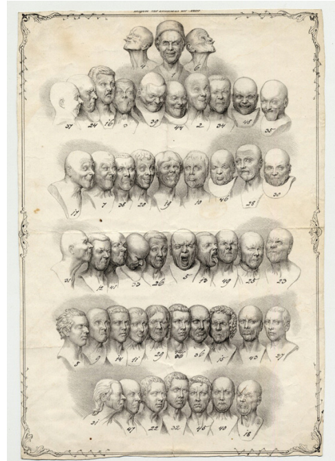
Messerschmidt's 'Character Heads', 1839. Matthias Rudolph Toma (Austrian, 1792–1869). Lithograph.

Some forty-nine of the sixty-nine heads Messerschmidt created are accounted for today. A lithograph on view in the exhibition has been a key element in reconstructing the series of Messerschmidt's heads. Created by Matthias Rudolph Toma after a drawing by Josef