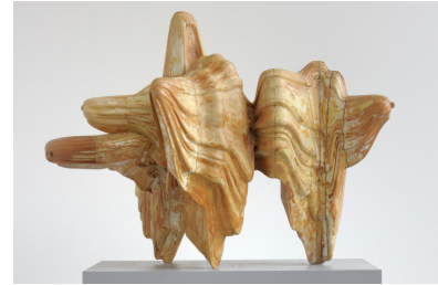
Mental Landscape , 2007. Tony Cragg (British, born 1949). Jesmonite. © Tony Cragg

The psychological theme of Messerschmidt's sculptures and their uncompromising aesthetic colored their public reception in Vienna. After his death and throughout the early 19 th century the Character Heads were viewed as oddities and exhibited in Vienna for popular entertainment. Over time, this perception changed and by the end of the 19 th century the heads were seen as useful examples of expression and emotion for art students to copy, and for students of anatomy and psychology to study. Some of the heads found their way into art-school storerooms in Vienna, while others were collected both by preeminent medical professionals and by art collectors. By the turn of the century the Character Heads found favor with Vienna's Jewish cultural elite, which supported avant-garde art movements such as the Viennese Secession and the Wiener Werkstätte, and also had links to Sigmund Freud. Their interests in unconventional contemporary art and the science of psychiatry combined to create a new culture of support for Messerschmidt's heads in Vienna.