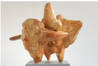
9. Tony Cragg British, born 1949 Mental Landscape, 2007 Jesmonite Object: H: 120 x W: 170.8 x D: 120 cm (47 1/4 x 67 1/4 x 47 1/4 in.) Collection of Tony Cragg EX.2012.4.52