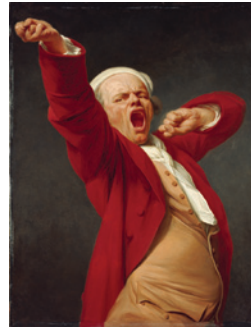
8. Joseph Ducreux French, 1735–1802 Self-Portrait, Yawning , by 1783 Oil on canvas Unframed: 114.3 x 88.9 cm (45 x 35 in.) 138.1 x 112.1 x 6.4 cm (54 3/8 x 44 1/8 x 2 1/2 in.) The J. Paul Getty Museum, Los Angeles 71.PA.56