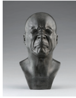
6. Franz Xaver Messerschmidt German, 1736–1783 The Ill-Humored Man, 1771–1783 Lead-tin cast Object: H: 38.7 x W: 23 x D: 23 cm (15 1/4 x 9 1/16 x 9 1/16 in.) Paris, Musée du Louvre, département des Sculptures; Société des Amis du Louvre EX.2012.4.11