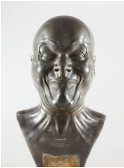
7. Franz Xaver Messerschmidt German, 1736–1783 A Strong Man , after 1770 Tin-lead cast Object: H: 44.5 x W: 26.7 x D: 23 cm (17 1/2 x 10 1/2 x 9 1/16 in.) Private Collection EX.2012.4.27