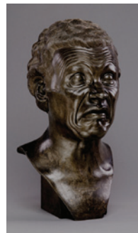
10. Franz Xaver Messerschmidt German, 1736–1783 Childish Weeping , after 1770 Tin-lead cast Object: H: 45.1 x W: 21.9 x D: 25.1 cm (17 3/4 x 8 5/8 x 9 7/8 in.) Courtesy of the Museum of Fine Arts, Budapest EX.2012.4.2