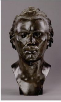
5. Franz Xaver Messerschmidt German, 1736–1783 Quiet Peaceful Sleep , after 1770 Lead-tin cast Object: H: 42.9 x W: 24.1 x D: 26 cm (16 7/8 x 9 1/2 x 10 1/4 in.) Courtesy of the Museum of Fine Arts, Budapest EX.2012.4.3