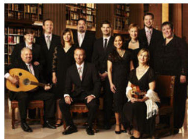
Rose Ensemble