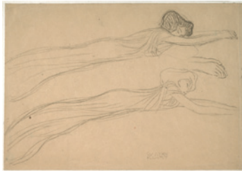
7. Gustav Klimt Austrian, 1862–1918 Two Studies for the Floating Figures of the 'Longing for Happiness' in the 'Beethoven Frieze', 1901–1902 Black chalk Unframed: 31.8 x 45.6 cm (12 1/2 x 17 15/16 in.) EX.2012.3.65