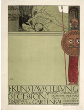
5. Gustav Klimt Austrian, 1862–1918 Poster of the First Secession Exhibition (uncensored version), 1898 Print Unframed: 69.5 x 53 cm (27 3/8 x 20 7/8 in.) EX.2012.3.2