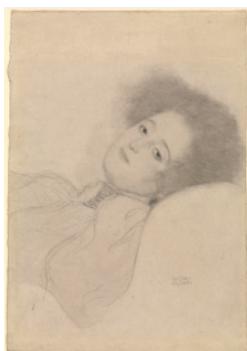
3. Gustav Klimt Austrian, 1862–1918 Portrait of a Young Woman Reclining, 1897–1898 Black chalk 45.5 x 31.5 cm (17 15/16 x 12 3/8 in.) The J. Paul Getty Museum, Los Angeles 2009.571