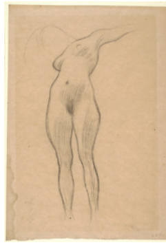
6. Gustav Klimt Austrian, 1862–1918 Floating Woman with Extended Arm (Study for 'Medicine'), 1900–1901 Black chalk Unframed: 41.5 x 27.3 cm (16 5/16 x 10 3/4 in.) EX.2012.3.56