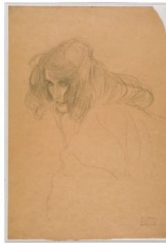
8. Gustav Klimt Austrian, 1862–1918 Study of a Woman's Head in Three-Quarter Profile for 'Impurity' in the 'Beethoven Frieze', 1901–1902 Black chalk Unframed: 45 x 31.3 cm (17 11/16 x 12 5/16 in.) EX.2012.3.70