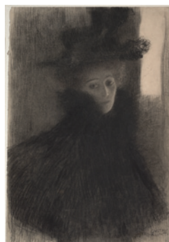
4. Gustav Klimt Austrian, 1862–1918 Drawing of a Woman with Cape and Hat in Three-quarter Profile, 1897–1898 Black and red crayon Unframed: 44.6 x 31.8 cm (17 9/16 x 12 1/2 in.)