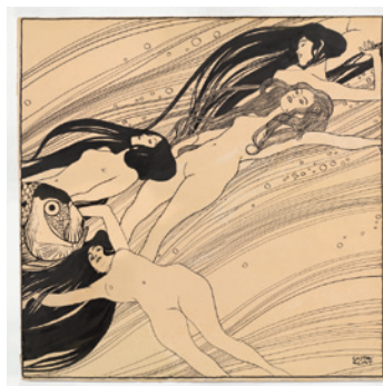
10. Gustav Klimt Austrian, 1862–1918 Fishblood, 1898 India ink and pen on brown paper Unframed: 40 x 40.3 cm (15 3/4 x 15 7/8 in.) Private collection, courtesy Galerie St. Etienne, New York EX.2012.3.15