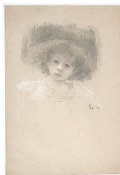
2. Gustav Klimt Austrian, 1862–1918 Half-length Portrait of a Child, 1895 Graphite and white chalk Unframed: 44.4 x 31 cm (17 1/2 x 12 3/16 in.) EX.2012.3.121