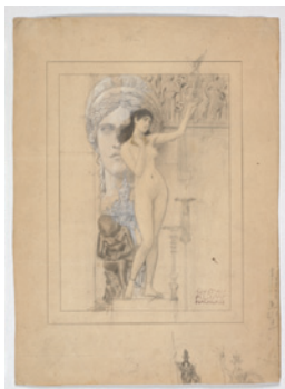
1. Gustav Klimt Austrian, 1862–1918 Preparatory Drawing for the 'Allegory of Sculpture', with Studies of the Athena Parthenos at the Bottom, 1888–1889 Graphite, blue crayon, heightened with gold Unframed: 44 x 30 cm (17 5/16 x 11 13/16 in.) EX.2012.3.36