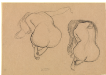
9. Gustav Klimt Austrian, 1862–1918 Two Studies of a Seated Nude with Long Hair, about 1901–1902 Black chalk and red pencil 31.7 x 45.2 cm (12 1/2 x 17 13/16 in.) The J. Paul Getty Museum, Los Angeles 2009.57.2