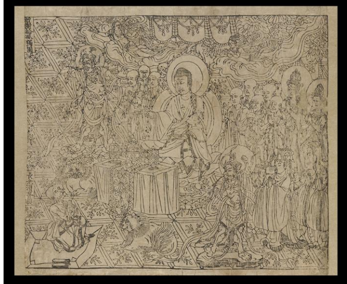
Diamond Sutra, 868 CE, ink on paper. London, British Library, Or.8210/P.2.

The exhibition in the Getty Research Institute galleries will include 43 manuscripts, paintings on silk, embroideries, preparatory sketches, and ritual diagrams loaned by the British Museum, the British Library, the Musée Guimet, and the Bibliothèque nationale de France—objects that have rarely, if ever, traveled to the United States. A highlight of the exhibition is the Diamond Sutra (a sacred Mahayana Buddhist text) that dates to the year 868 CE. On loan to the Getty from the British Library, the Diamond Sutra is the world's oldest dated complete printed book.