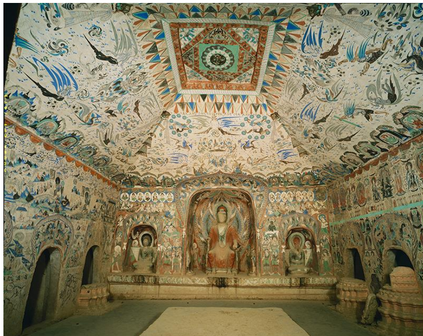
Cave 285, view of the interior, Western Wei dynasty (535–556 CE). Mogao caves, Dunhuang, China.

For more information about the exhibition, visit www.getty.edu/cavetemples