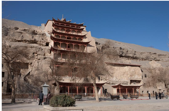
The nine-story temple (Cave 96) houses a colossal Tang dynasty Buddha statue some thirty-three meters high. Mogao caves, Dunhuang, China.

LOS ANGELES – In May 2016, the Getty will present a major exhibition on the spectacular Buddhist cave temples located near Dunhuang, an oasis in Northwest China on the ancient Silk Road. Visitors will immerse themselves in the art and history of the Mogao Grottoes, an extensive cave temple complex and UNESCO World Heritage site, which thrived as a Buddhist center from the 4 th to the 14 th centuries.