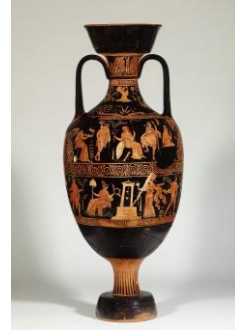
Image © Staatliche Museen zu Berlin, Antikensammlung. Photo: Johannes Laurentius