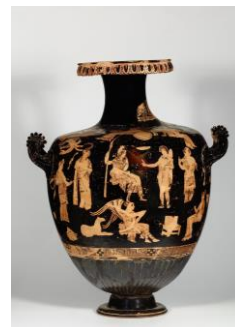
Image © Staatliche Museen zu Berlin, Antikensammlung. Photo: Johannes Laurentius