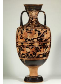
Image © Staatliche Museen zu Berlin, Antikensammlung. Photo: Johannes Laurentius