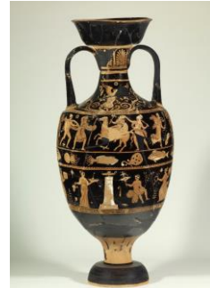
Image © Staatliche Museen zu Berlin, Antikensammlung. Photo: Johannes Laurentius