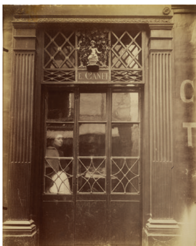
3. Eugène Atget French, 1857–1927 Petit Bacchus, 61, rue St. Louis en l'Île (The Little Bacchus Café, rue St. Louis en l'Île), 1901–1902 Albumen silver print Image: 22.1 x 17.8 cm (8 11/16 x 7 in.) The J. Paul Getty Museum, Los Angeles 90.XM.124.13