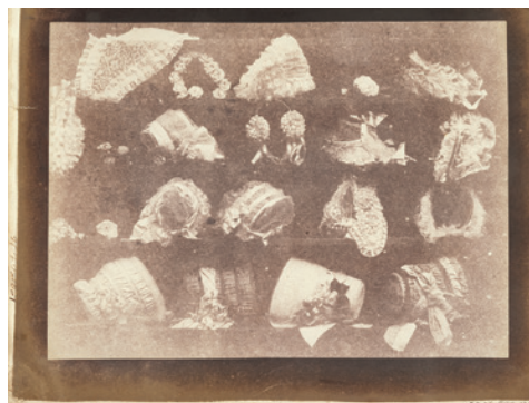
2. William Henry Fox Talbot English, 1800–1877 [The Milliner's Window], before January 1844 Salted paper print from a Calotype negative Image: 14.3 x 19.5 cm (5 5/8 x 7 11/16 in.) The J. Paul Getty Museum, Los Angeles 84.XZ.574.131