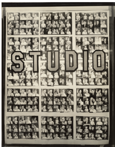
1. Walker Evans American, 1903–1975 Penny Picture Display, Savannah, 1936 Gelatin silver print Image: 25.6 x 19.9 cm (10 1/16 x 7 7/8 in.) The J. Paul Getty Museum, Los Angeles 84.XM.956.477