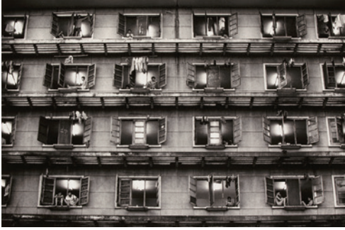
5. Sebastião Salgado Brazilian, born 1944 Ho Chi Minh City, Vietnam, negative 1995; print 2009 Gelatin silver print Image: 34.3 x 51.4 cm (13 1/2 x 20 1/4 in.) The J. Paul Getty Museum, Los Angeles 2009.33.4