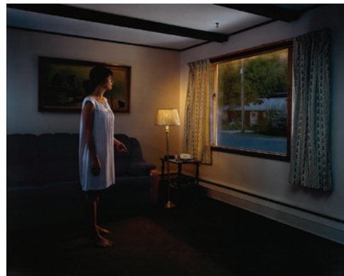
8. Gregory Crewdson American, born 1962 Untitled , 2002 Chromogenic print Image: 122 x 152 cm (48 1/16 x 59 13/16 in.) The J. Paul Getty Museum, Los Angeles, Gift of Trish and Jan de Bont © Gregory Crewdson 2012.81