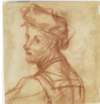
2. Andrea del Sarto Italian, 1486–1530 Head and Shoulders of a Man, Seen from Behind, Turning , about 1517–1518 Red chalk 13 x 12.6 cm (5 1/8 x 4 15/16 in.) Gabinetto Disegni e Stampe, Gallerie degli Uffizi, Florence Su concessione del Ministero dei beni e delle attività culturali e del turismo EX.2014.3.35