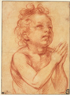
29. Andrea del Sarto Italian, 1486–1530 Study of an Infant Praying, 1525–1529 Red chalk 18.4 x 13.5 cm (7 1/4 x 5 5/16 in.) Musée du Louvre, Département des Arts Graphiques EX.2014.3.19