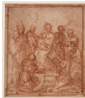
22. Andrea del Sarto Italian, 1486–1530 Compositional Study of the Madonna and Child with Saints, about 1528 Culture: Italian Red chalk 15.6 x 13.5 cm (6 1/8 x 5 5/16 in.) Kupferstichkabinett - Staatliche Museen zu Berlin EX.2014.3.46