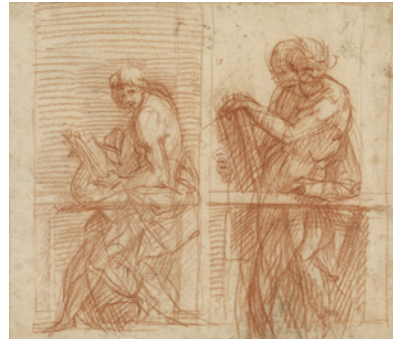
24. Andrea del Sarto Italian, 1486–1530 Study of Figures Behind a Balustrade , about 1522 Red chalk (recto); 17.5 x 20 cm (6 7/8 x 7 7/8 in.) The J. Paul Getty Museum, Los Angeles 92.GB.74