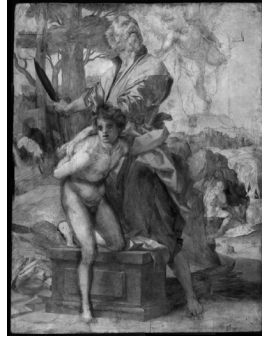
18. Andrea del Sarto Italian, 1486–1530 Infrared reflectogram of The Sacrifice of Isaac, about 1528 Oil on panel 178 x 138 cm (70 1/16 x 54 5/16 in.) The Cleveland Museum of Art, Delia E. Holden and L. E. Holden Funds, 1937.577 EX.2014.3.57