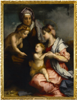
5. Andrea del Sarto Italian, 1486–1530 The Medici Holy Family , 1529 Oil on panel 140 x 104 cm (55 1/8 x 40 15/16 in.) Istituti museali della Soprintendenza Speciale per il Polo Museale Fiorentino Su concessione del Ministero dei beni e delle attività culturali e del turismo EX.2014.3.6