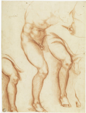
19. Andrea del Sarto Studies after the Laocoön , about 1528 Red chalk 28.3 x 21.7 cm (11 1/8 x 8 9/16 in.) Gabinetto Disegni e Stampe, Gallerie degli Uffizi, Florence Su concessione del Ministero dei beni e delle attività culturali e del turismo EX.2014.3.41