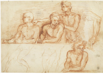
23. Andrea del Sarto Italian, 1486–1530 Studies of Figures Seated and Standing behind a Table , about 1526–1527 Red chalk 25.6 x 36.3 cm (10 1/16 x 14 5/16 in.) Gabinetto Disegni e Stampe, Gallerie degli Uffizi, Florence Su concessione del Ministero dei beni e delle attività culturali e del turismo EX.2014.3.31