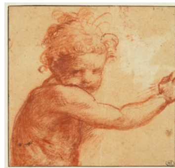
10. Andrea del Sarto Italian, 1486–1530 Study of a Child, about 1517 Red chalk 10.6 x 11.1 cm (4 3/16 x 4 3/8 in.) Musée du Louvre, Département des Arts Graphiques EX.2014.3.21