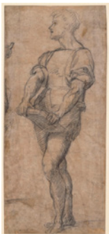
21. Andrea del Sarto Italian, 1486–1530 Study of a Standing Young Man Holding a Book, about 1515 Black chalk 37.1 x 16.2 cm (14 5/8 x 6 3/8 in.) Kupferstichkabinett - Staatliche Museen zu Berlin EX.2014.3.44