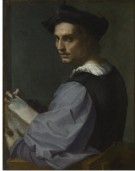
1. Andrea del Sarto Italian, 1486–1530 Portrait of a Young Man , about 1517–1518 Oil on canvas 72.4 x 57.2 cm (28 1/2 x 22 1/2 in.) The National Gallery, London EX.2014.3.5