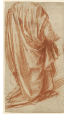
26. Andrea del Sarto Italian, 1486–1530 Drapery Study , about 1517 Red chalk 27.9 x 15.2 cm (11 x 6 in.) The J. Paul Getty Museum, Los Angeles 89.GB.53