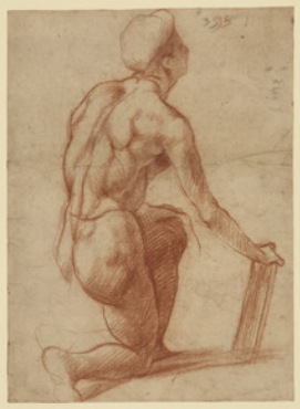
25. Andrea del Sarto Italian, 1486–1530 Study of a Kneeling Figure with a Sketch of a Face , 1522–1526 Red and black chalk (recto) 30.1 x 19.8 cm (11 13/16 x 7 13/16 in.) The J. Paul Getty Museum, Los Angeles 84.GB.7