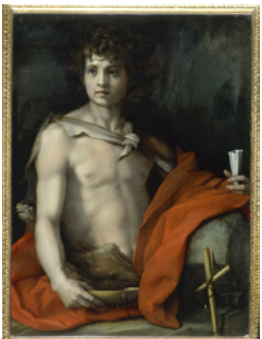
7. Andrea del Sarto Italian, 1486–1530 Saint John the Baptist , about 1523 Oil on panel 94 x 68 cm (37 x 26 3/4 in.) Istituti museali della Soprintendenza Speciale per il Polo Museale Fiorentino Su concessione del Ministero dei beni e delle attività culturali e del turismo EX.2014.3.7