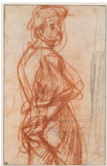
9. Andrea del Sarto Italian, 1486–1530 Study of a Standing Male Figure , about 1525 Red and black chalks 25 x 16 cm (9 13/16 x 6 5/16 in.) Musée du Louvre, Département des Arts Graphiques EX.2014.3.9