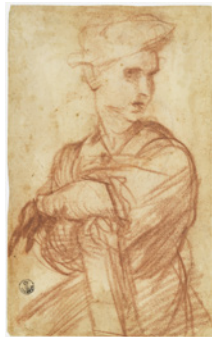
3. Andrea del Sarto Study for a Portrait of a Man, Three-Quarter Length , about 1517–1518 Culture: Italian Red chalk 18.8 x 11.6 cm (7 3/8 x 4 9/16 in.) Gabinetto Disegni e Stampe, Gallerie degli Uffizi, Florence Su concessione del Ministero dei beni e delle attività culturali e del turismo EX.2014.3.30