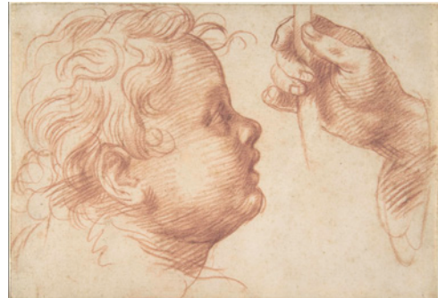
28. Andrea del Sarto Italian, 1486–1530 Studies of a Head and a Hand, 1510 Red chalk 14.2 x 20.5 cm (5 9/16 x 8 1/16 in.) The Metropolitan Museum of Art, Rogers Fund, 1996 (1996.12) EX.2014.3.61