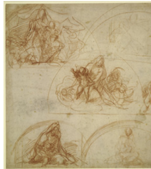
4. Andrea del Sarto Italian, 1486–1530 Five Studies for a Lunette with the Virgin and Child , about 1525 Red chalk 28.9 x 26.1 cm (11 3/8 x 10 1/4 in.) The British Museum, 1912,1214.2. Donated by John Postle Heseltine, 1912 EX.2014.3.4