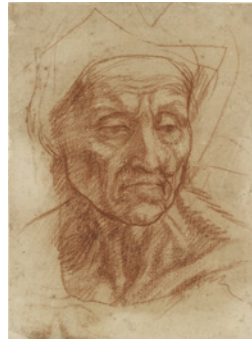
6. Andrea del Sarto Italian, 1486–1530 Study of an Old Woman's Head, about 1529 Red chalk 25 x 18.6 cm (9 13/16 x 7 5/16 in.) The Ashmolean Museum, Oxford. Presented by a Body of Subscribers, 1846. EX.2014.3.54