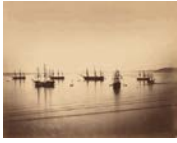
49. Gustave Le Gray French, 1820 - 1884 The French Fleet, Cherbourg, August 1858 Albumen silver print from a glass negative Image: 30.8 × 39.1 cm (12 1/8 × 15 3/8 in.) The J. Paul Getty Museum, Los Angeles 2014.57