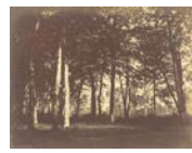
Image: 26.4 × 33.7 cm (10 3/8 × 13 1/4 in.) The J. Paul Getty Museum, Los Angeles 84.XA.412.10