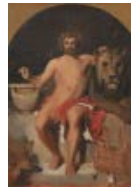
117. Charles Nègre French, 1820 - 1880 Universal Suffrage, a Study, 1850 Oil on canvas Image: 24.3 x 18.6 cm (9 9/16 x 7 5/16 in.) Private collection Paris EX.2016.4.40