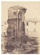
112. Charles Nègre French, 1820 - 1880 Saint-Gilles, 1852 Salted paper print from a paper negative Image: 32 x 23 cm (12 5/8 x 9 1/16 in.) The J. Paul Getty Museum, Los Angeles 2015.43.8