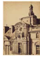
50. Gustave Le Gray French, 1820 - 1884 Pavillon Rohan, the Louvre, Paris, about 1857 - 1859 Albumen silver print from a glass negative Image: 50 × 36.3 cm (19 11/16 × 14 5/16 in.) The J. Paul Getty Museum, Los Angeles 2015.38