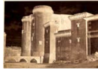
113. Charles Nègre French, 1820 - 1880 Tarascon, 1852 Waxed paper negative Image: 23.7 x 33.2 cm (9 5/16 x 13 1/16 in.) The J. Paul Getty Museum, Los Angeles 2015.43.9