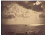
Image: 24 × 37.9 cm (9 7/16 × 14 15/16 in.) The J. Paul Getty Museum, Los Angeles 84.XA.412.9