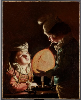
Two Boys with a Bladder , about 1769-70, oil on canvas, by Joseph Wright of Derby (1734–1797)