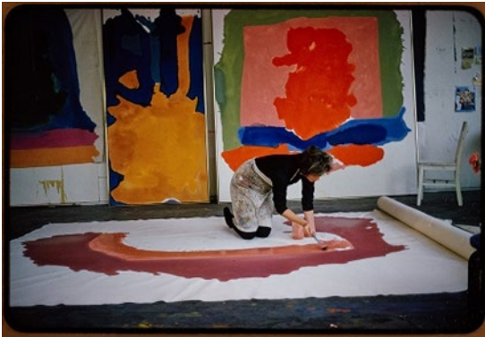
5. Helen Frankenthaler in her East 83rd Street and Third Avenue studio, New York, April 1964