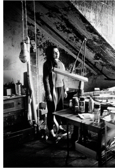
6. Eva Hesse in her Bowery studio, ca. 1966, photographer unknown. © The Estate of Eva Hesse. Courtesy Hauser & Wirth