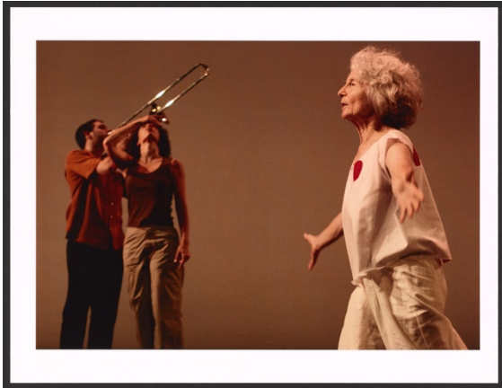
1. Unbuttoned Sleeves , 2005, REDCAT, LA, Photographer: Carol Petersen