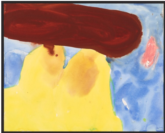
3. Red Hat in Yellow and Red Landscape , Simone Forti, 1966. Getty Research Institute, 2019.M.23