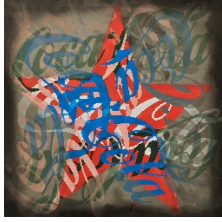
Small Star Coca-Cola III Pécs, Hungary, 1988 Sándor Pinczehelyi (Hungarian, b.1946) Oil on canvas The Wende Museum © Sándor Pinczehelyi