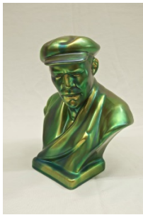
Lenin Bust Pécs, Hungary, 1983 Artist Unknown Zsolnay porcelain The Wende Museum