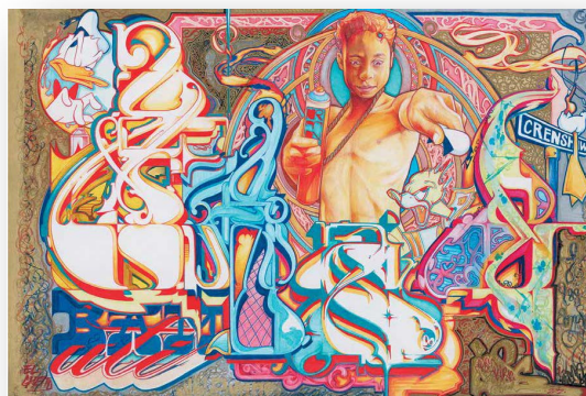
Untitled artwork ©AiseBorn

L.A. Graffiti Black Book (Getty Publications, $35) reproduces, for the first time, all of the artworks in LA Liber Amicorum , and commemorates a moment when leading local artists came together to create a L.A. book of friends.