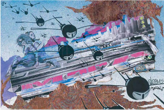
Untitled artwork © Blossm and Petal