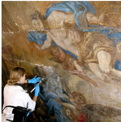
3. Polly Westlake, conserving the wall paintings in the church of Our Lady of Victory, Valetta, Malta.