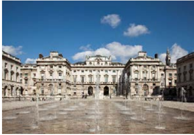
1. The Courtauld Somerset House.