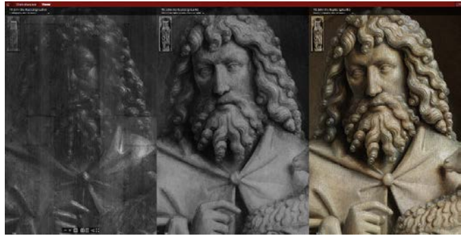
John the Baptist in grisaille, X-ray, IR and photo.