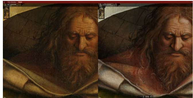
Prophet Micah, before and after.

The conservation work also led to the discovery that around 70% of Van Eyck's original paint layer on the panels of the closed altarpiece had been hidden beneath overpaint for centuries, requiring painstaking removal. The removal of this paint is reflected in the images seen online.