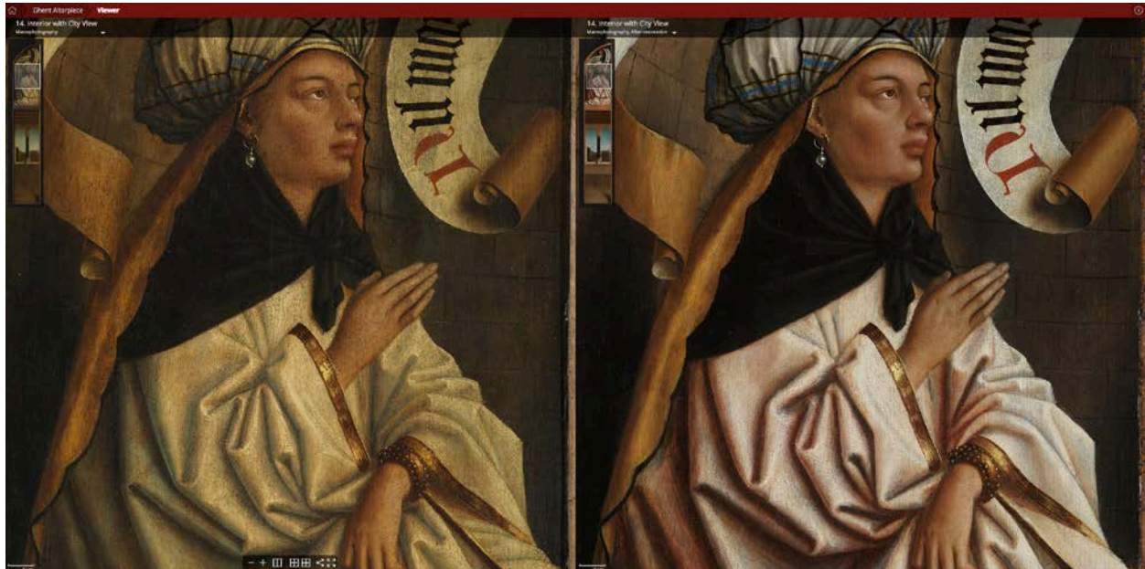
Detail of Erythraean Sibyl, before and after restoration, change of colour.

LOS ANGELES – The Getty Foundation and the Royal Institute for Cultural Heritage (KIK-IRPA, Brussels) announced today the launch of major enhancements to the website 'Closer to Van Eyck,' which provides breathtaking details of one of the most important works of art in the world, the Ghent Altarpiece. Enhancements include new images of the work under various stages of conservation treatment, a larger range of technical images, and the ability to see and compare multiple views of the painting at the same time.